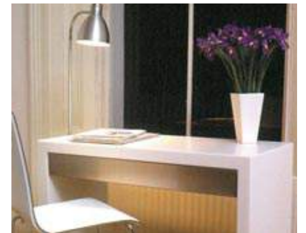
"TABLESTORE", LONDON, UNITED KINGDOM. DESIGN ADRIAN WRIGHT. BRILLIANT SLAB COLLECTION IN CORIAN® GLACIER WHITE.