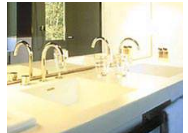
"THE HOTEL", LUCERNE, SWITZERLAND. DESIGNED JEAN NOUVEL. VANITY TOP AND BOWLS IN ONE PIECE IN CORIAN® GLACIER WHITE.