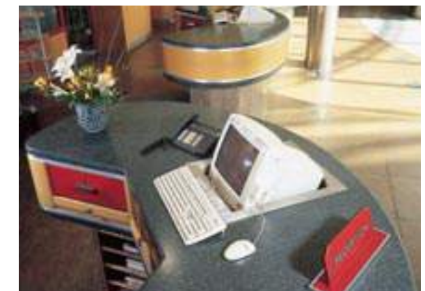
MÖVENPICK HOTEL, OBERURSEL, GERMANY. THREE ROUND RECEPTION DESKS IN CORIAN® RAIN FOREST COMBINED WITH WOOD.