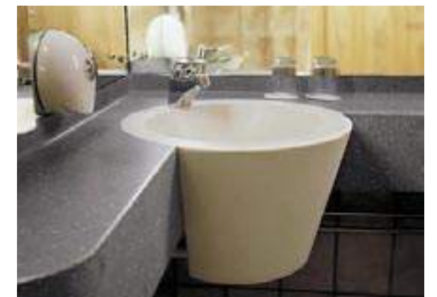
RADISSON SAS ROYAL VIKING HOTEL, STOCKHOLM, SWEDEN. DESIGN SNICKARBOLAGET. VANITY TOP AND BOWL IN CORIAN® CAMEO WHITE AND CORIAN® GRAY FIELDSTONE.