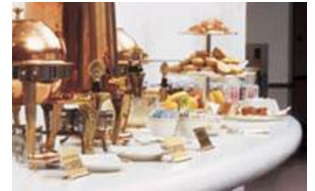
BUFFET IN CORIAN® GLACIER WHITE.

In the background, the subdued lighting of the bar helps guests relax. In a warm, muted atmosphere, the Corian® surface uses colours daringly to reflect the cocktails prepared by the barman. Through informal chats, confidences or the final details of a negotiation, the world is shaped and reshaped along this bar or around the occasional tables in Corian®. And nothing not a spilt drink or a forgotten cigarette will mar its beauty and elegance.