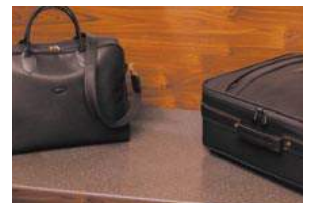
LUGGAGE RACK IN CORIAN® CANYON.