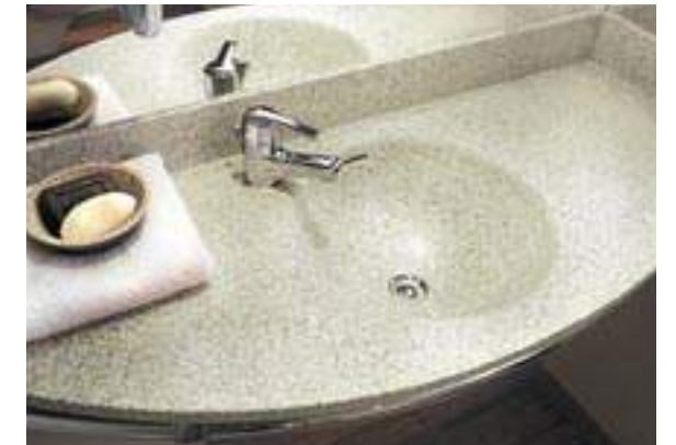
NOVOTEL, ROTTERDAM, THE NETHERLANDS. AN "ALL IN ONE" VANITY BOWL IN CORIAN® PYRENEES.

On a functional level, Corian® offers impeccable standards of hygiene. Solid and non-porous, it is joined without visible seams, creating vanity tops that appear to have been made from a single piece of Corian® and are therefore simple to clean.