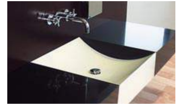
"ZEN" VANITY, MILANO, ITALY. DESIGN MASSIMO FUCCI. VANITY IN CORIAN® NOCTURNE AND CORIAN® BONE.

Corian® also combines beautifully with wood, stainless steel or glass to create original units. Whether you opt for a revitalising shower or a relaxing bath, Corian® ensures an unforgettable experience.