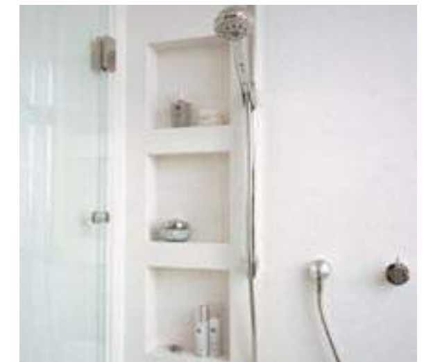
CORIAN® SHOWER WALLS WITH FITTED SHELVES. DESIGN CHARLES ZÄCH.