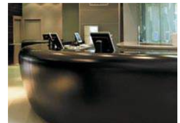
ENTRANCE OF THE LAGUNA PALACE HOTEL, MESTRE, ITALY. DESIGN STUDIO MARCO PIVA.