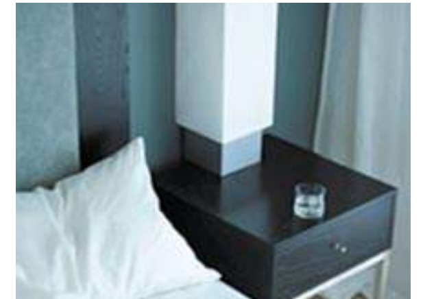
BEDSIDE TABLE TOP IN CORIAN® NOCTURNE.

A bedside table, a desk and a luggage rack here reveal its clean, refined lines, while a stylish shelf unit there blends effortlessly into a tight corner.