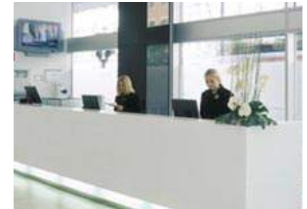
NORDIC LIGHT HOTEL, STOCKHOLM, SWEDEN. DESIGN SJÖÖ FABRIKS. RECEPTION DESK IN CORIAN® CAMEO WHITE.

It makes perfect sense, thanks to its inherent hygiene and functionality, its style and flexibility in design. But Corian® has an added dimension when combined with other materials, giving hotels a soul and creating a unique atmosphere. Corian® creates subtle, individual environments where elegance and comfort are perfectly balanced.