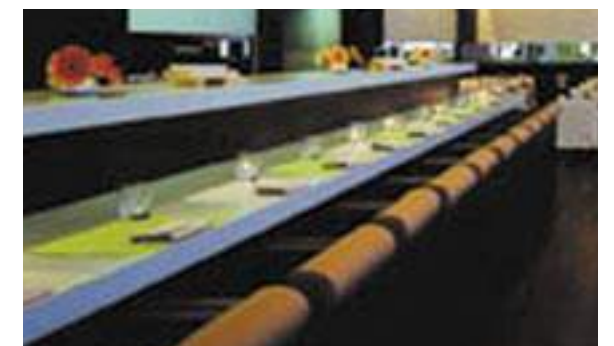
SIDE HOTEL, HAMBURG, GERMANY. DESIGN MATTEO THUN AND BOB WILSON. DETAIL OF SUSHI BAR COUNTER IN CORIAN® SEAGRASS.