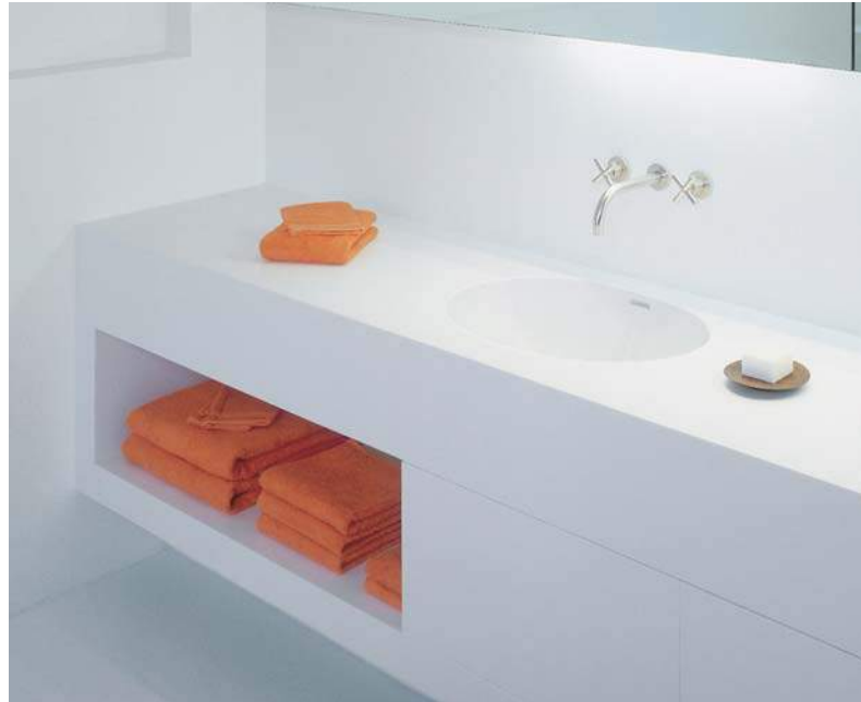
Design Sofie Lewyllie