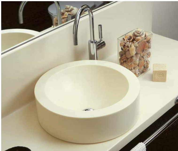
Design Massimo Fucci