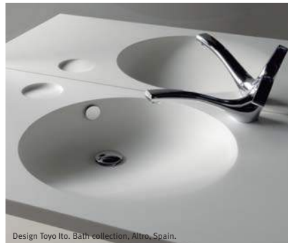
Design Toyo Ito. Bath collection, Altro, Spain.