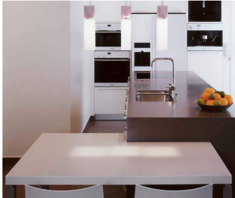
Design Sofie Lewyllie