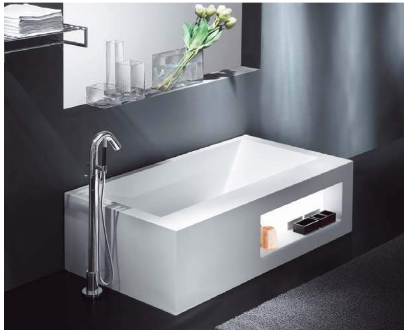
Design Giampiero Peia/Cisal