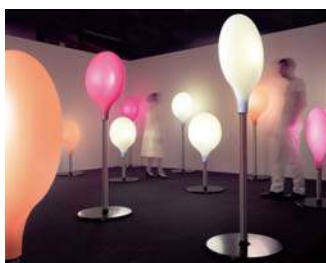
Design Marc Newson

Corian® sinks and bowls come in a wide array of elegant shapes and sizes. Seamlessly combine them with Corian® surfaces to eliminate joints where dirt, germs and mildew can hide.