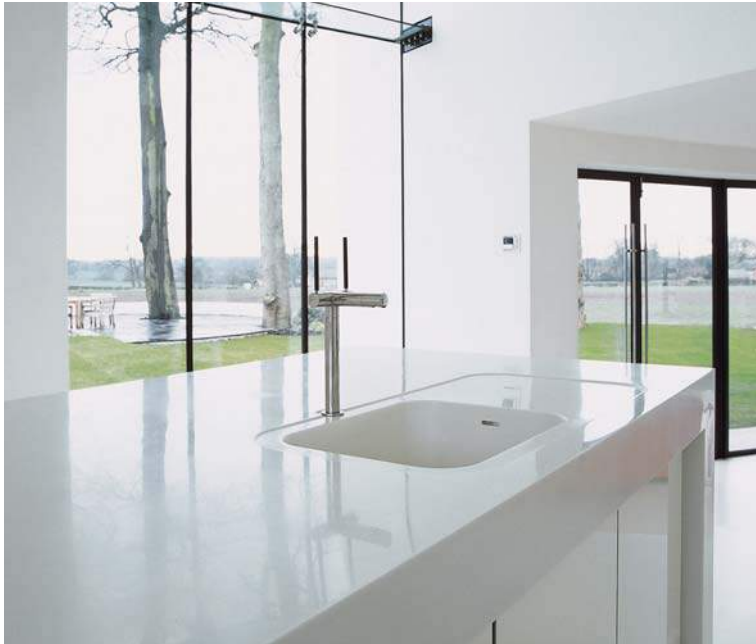
Design Ellis Williams Architects

Give it a distinctive flavour with Corian®.