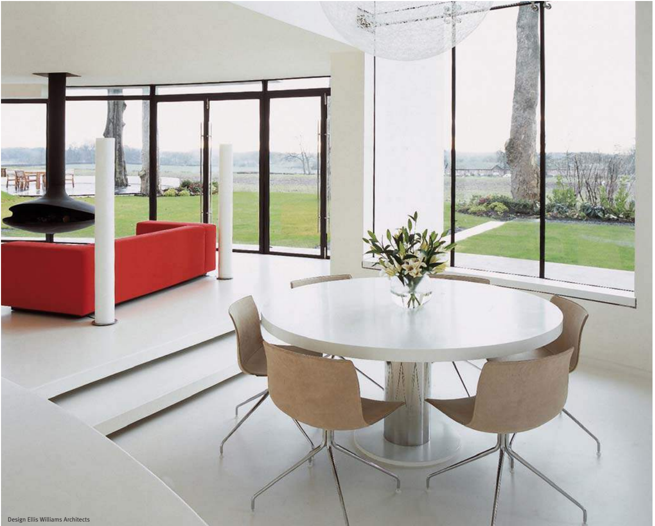
Design Ellis Williams Architects