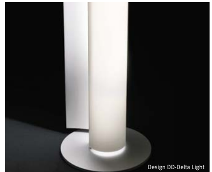
Design DD-Delta Light