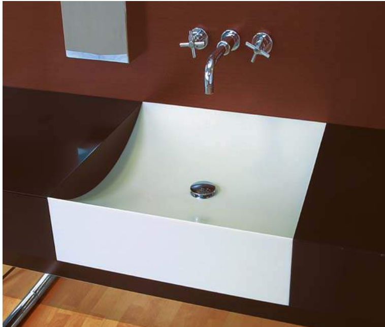
Design Massimo Fucci

It's your bathroom. Make waves with Corian®.