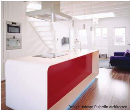
Design Hofman Dujardin Architecten